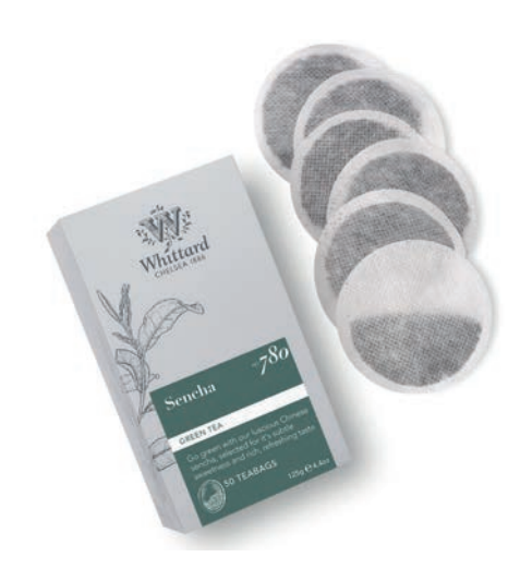
Jasmine 100g Case Size: 12 Code: 350256

Our traditional teabags featuring verdant green tea leaves, scented with blossoms of dusk-blooming jasmine.