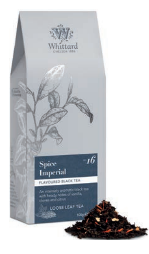
Spice Imperial 100g Case Size: 12 Code: 340273

An intensely aromatic loose leaf black tea infused with flavours of spice and citrus.