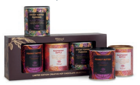
Limited Edition Creative Hot Chocolate Selection 3x120g Case Size: 6 Code: 344416

The cream of the crop in one beautifully packaged set. Our three signature hot chocolates: indulgent, milky Luxury, buttery-sweet Luxury White and richly intense 70% Cocoa.