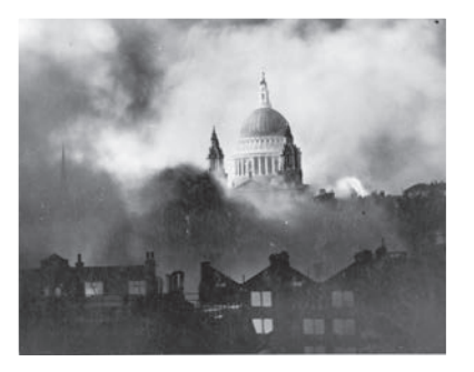
1940 The Blity