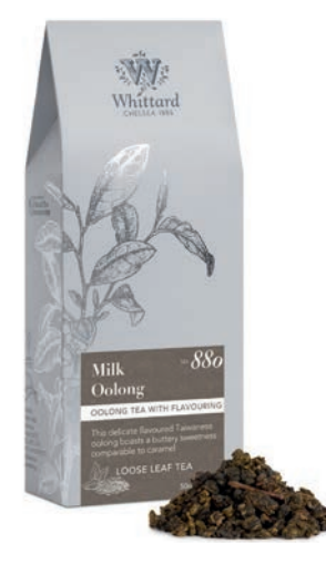
Milk Oolong 100g Case Size: 12 Code: 345603

Creamy and sweet, this famous loose leaf flavoured oolong from Taiwan's Nantou region has a butter-rich softness comparable to caramel.