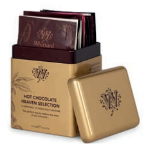
Hot Chocolate Heaven Selection Tin 12x20g Case Size: 6 Code: 347609

Delight a hot chocoholic with this delectable selection of six luxury milk and white-based hot chocolates inspired by our favourite confectionery.