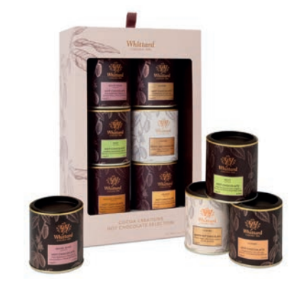
Cocoa Creations Hot Chocolate Gift Set 6x120g Case Size: 5 Code: 339820

When it comes to hot chocolate, we like to push our imaginations to the limit. Exhibit A: this showstopping selection of three of our most creative milk and white flavours, presented in a Whittard-branded gift box.