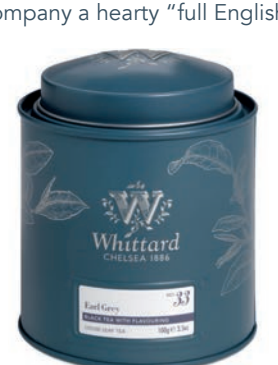
Earl Grey 100g Case Size: 6 Code: 314294

We've recreated the taste of a classic "Meigui Gongfu" rose tea by using a loose leaf black tea for the base, imbued with subtle floral flavours and scattered with rose petals.