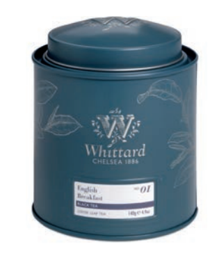
English Breakfast 140g Case Size: 6 Code: 314252

A smooth, versatile and invigorating loose leaf black tea with a robust malty richness – particularly delicious served with a splash of milk to accompany a hearty "full English".